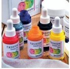
Fashion Marbling Set

Homecrafts are pleased to be able to offer you everything you'll need in the kits below! Just click through to take a look!