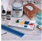
Marbling Starter Pack

HEMECRAFTS DIRECT PO BOX 38 LEICESTER LE1 9BU